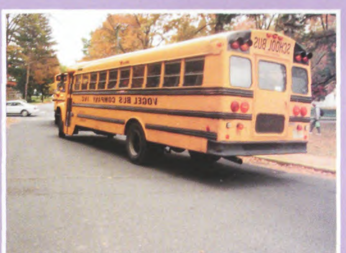
WE ALL LIVE IN A YELLOW SUBMARINE! The bus is a very popular way for students to go home. Although it may not have been the most luxurious way to travel, it was quick and easy. If you were too slow getting ready to leave, you may have missed the bus, since it always left right on time!