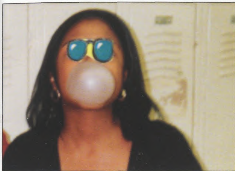
Not to burst your bubble Violator Nine, but chewing gum is one of those things we don't do here at Spiffy High.