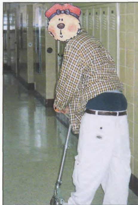
Sorry Violator Ten, exposure of excessive garments while riding a scooter is strictly forbidden.