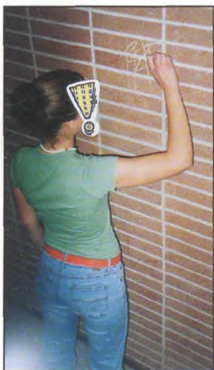
Violator Eleven plans to use the tree preservation excuse if she gets caught doing graffiti.