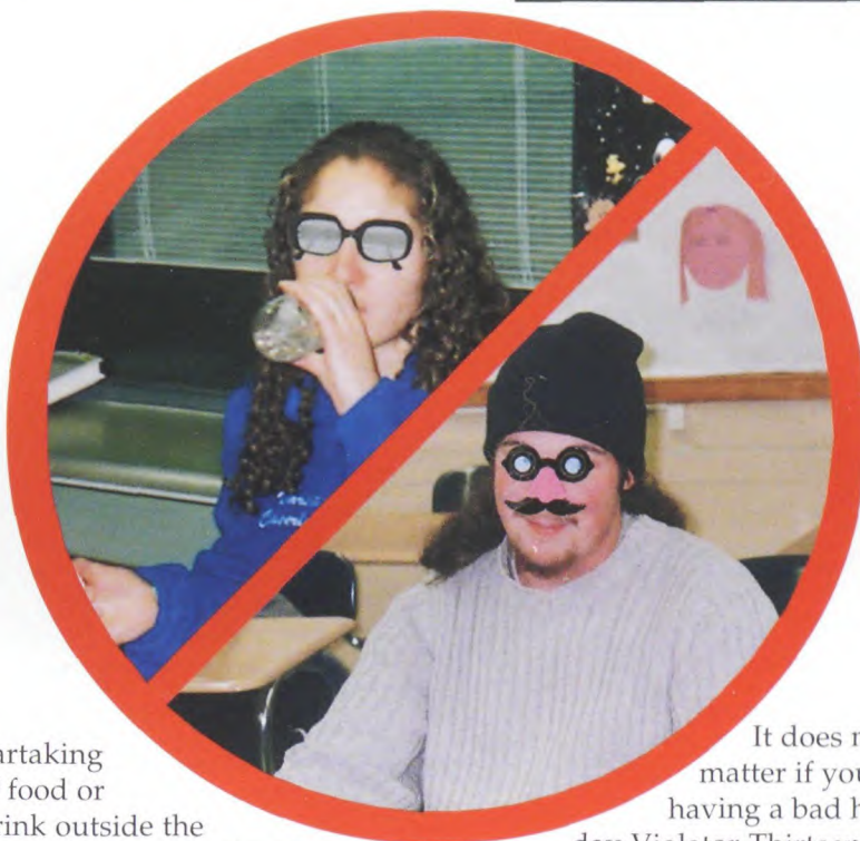
Partaking of food or drink outside the eating area is prohibit Violator Twelve.