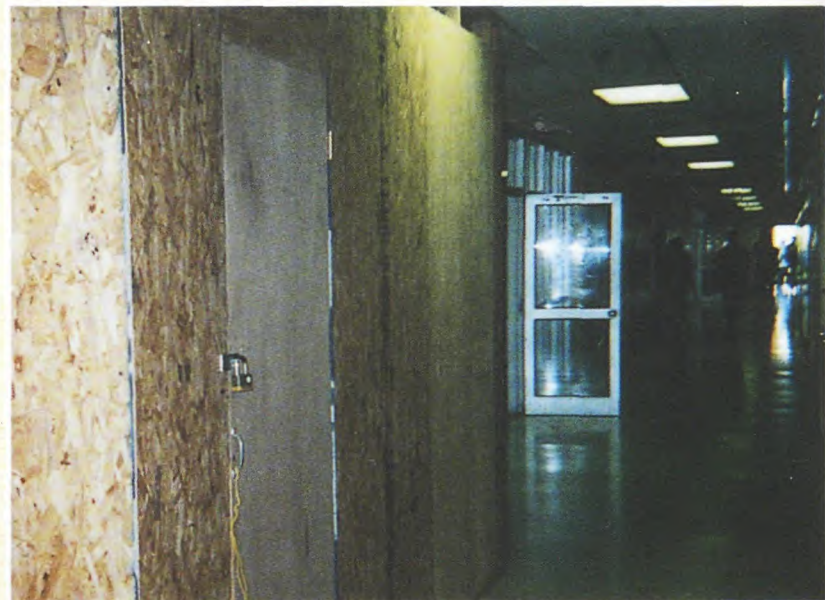
Above: The hallways become more narrow while construction is taking place causing mass traffic jams between periods.