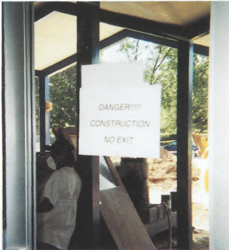
Below: The doors to the main lobby are temporarily out of commission.