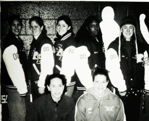
The graduating senior swimmers will take away a lot of power and spirit from next year's team. The majority of seniors have been on the team since their freshman year.