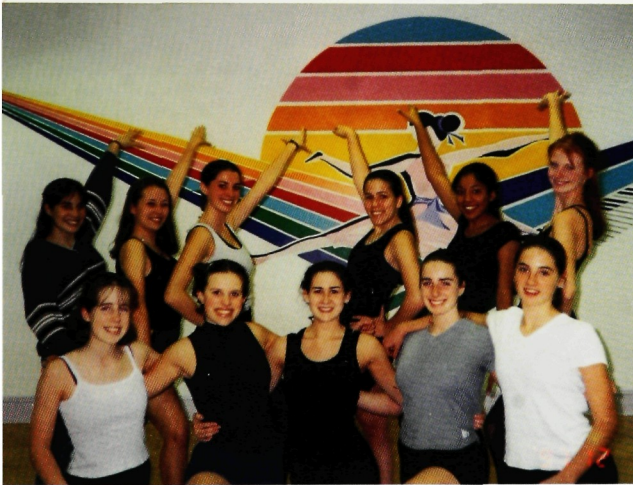
Dance 2000, these girls take time to appreciate and participate in the fine art of dancing.