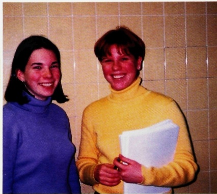
Sleek, stylish, and comfortable, turtle necks in any color are a must have.