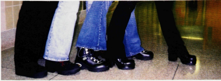
If you are off for a long trek through the halls, it looks like big black boots are the way to go.