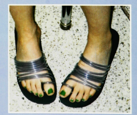
When wearing blue sandals, green toe