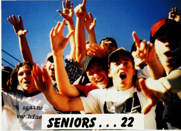
SENIORS . . . 22