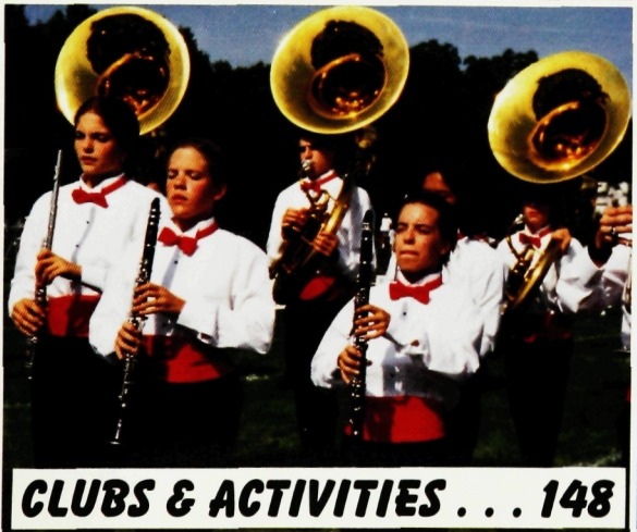
CLUBS & ACTIVITIES . . . 148