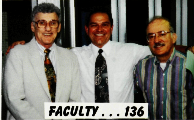
FACULTY . . . 136