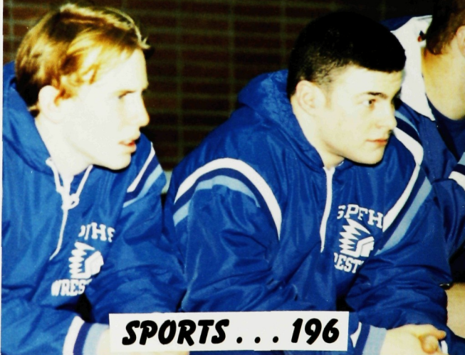
SPORTS . . . 196