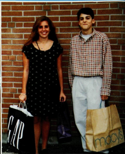
Flair For Fashion