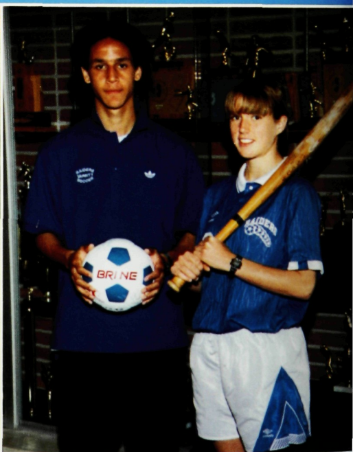
Future Sports Hall Of Famers