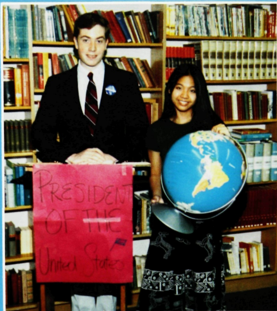
"We've Got The Whole World In Our Hands"