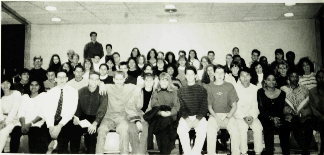
Below: FBLA in its entirety.