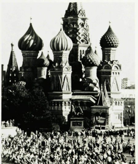
Victory Demo at Red Square