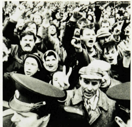
Independence Rally In Lithuania