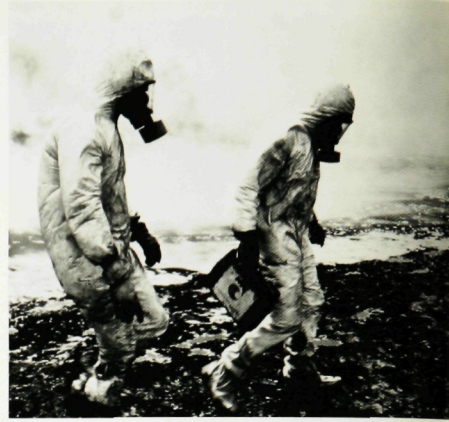
Kuwait Oil Fire

Clarence Thomas was appointed to the Supreme Court in 1991 after surviving charges of sexual misconduct leveled at him at Professor Anita Hill.