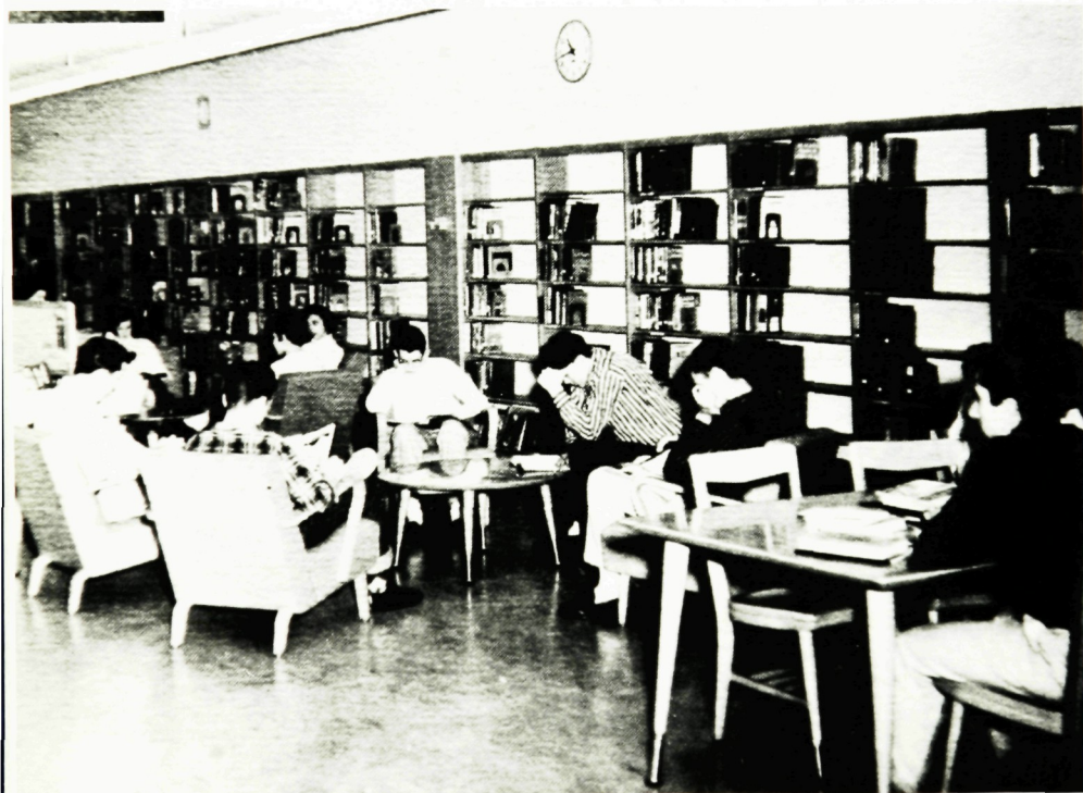
It once was the High School library; today it's the Multi-Purpose Room.