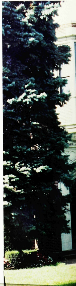
The original SPFHS, now Park Middle School. It opened during the Coolidge presidency.