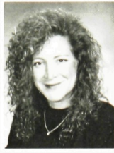
Ronnie Siegel Fine Arts