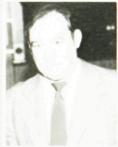
Charles Waters Science Department