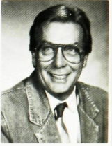
James Tuttle Media Center