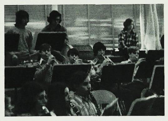
Sergeant Pepper's Lonely Hearts Club Band.

In addition to the new courses added this year, the Music Department offerings include instrumental and vocal music. These courses further the department's goals of giving all students a chance to experience a sense of personal satisfaction through the world of music.