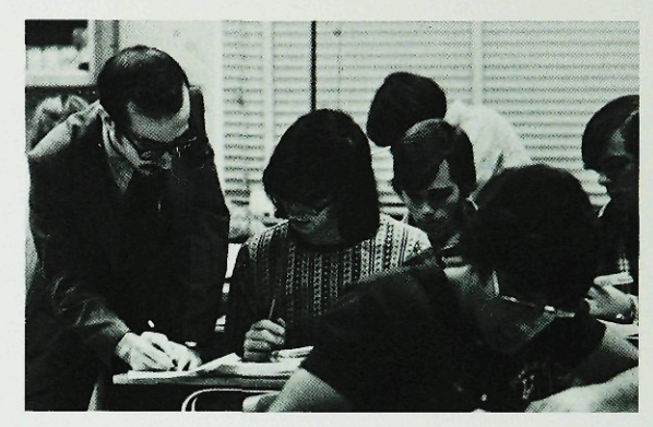
The Science Department helps students individually.