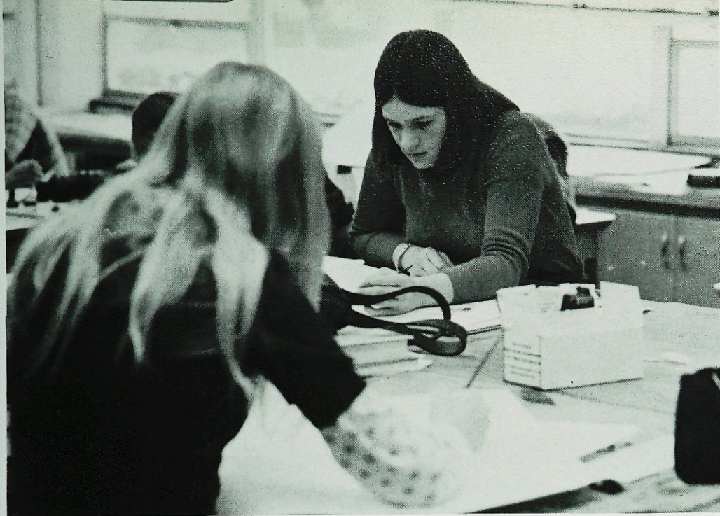
Recognizing individual capabilities