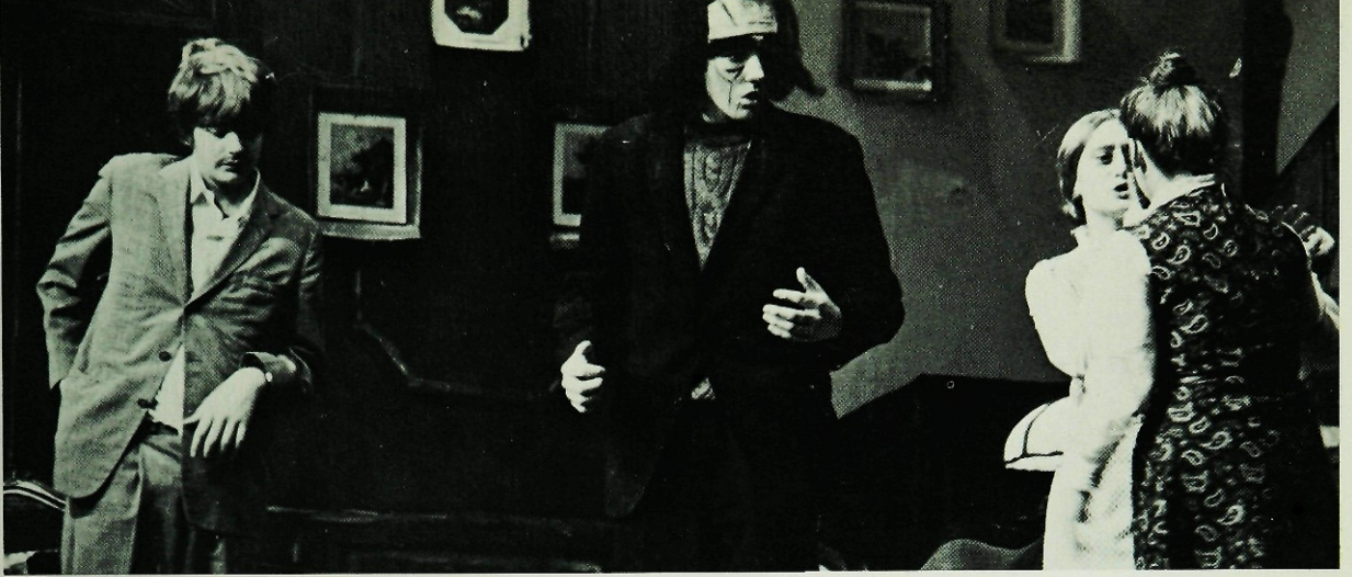
"Arsenic and Old Lace" — a portrayal of comedy and chaos.