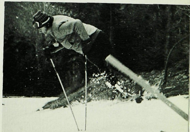
One brave soul tries out a few of his own tricks.