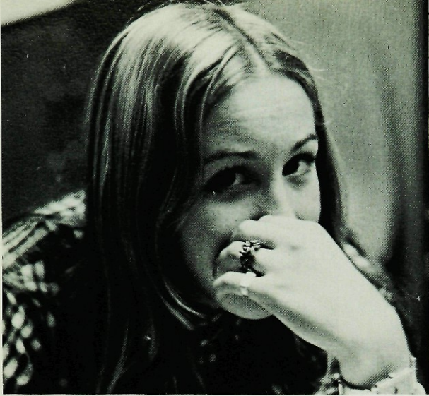
Kippy Baser. Model #1238. Able to withstand severe agony and distress. Approach with caution.