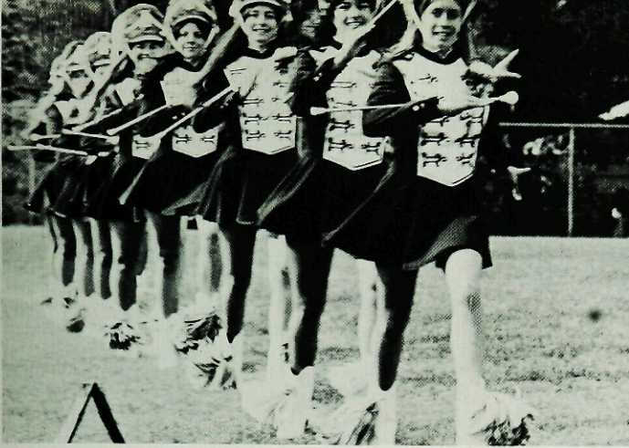
Ten Little Indians.