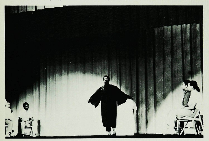
"Black Kaleidoscope" presented various aspects of Black art.