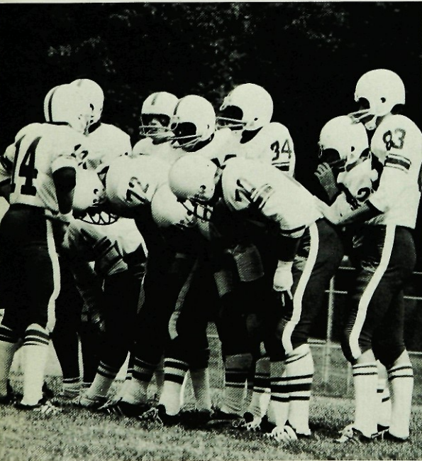
The Raider offense scheming up another dazzling play.