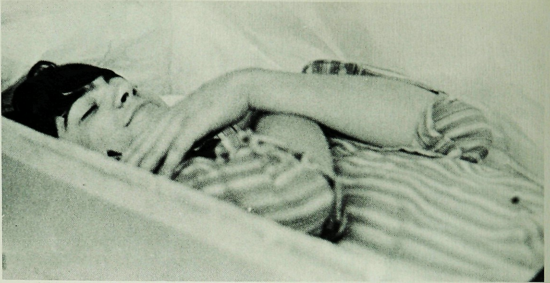
Some people can really relax. Patrick Spina.