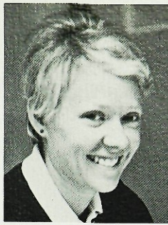
trudi ke sting