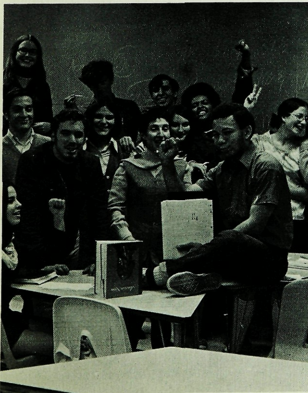
Power to the people!