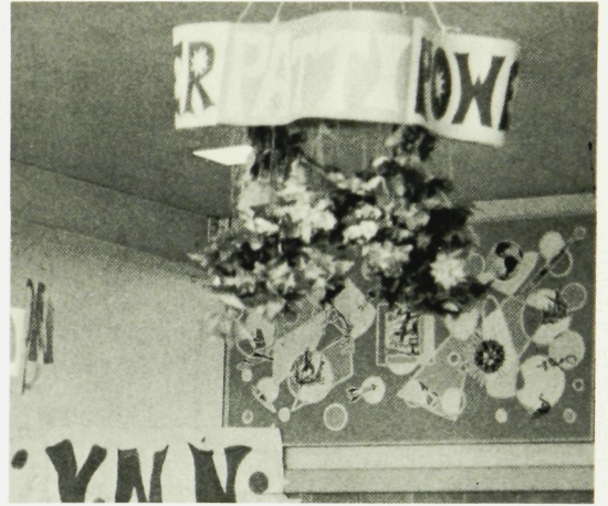
Patti Reeser's political strategy included winning the votes of the flower people.