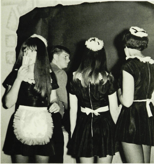
Scotch Plains' own barmaids take a break.