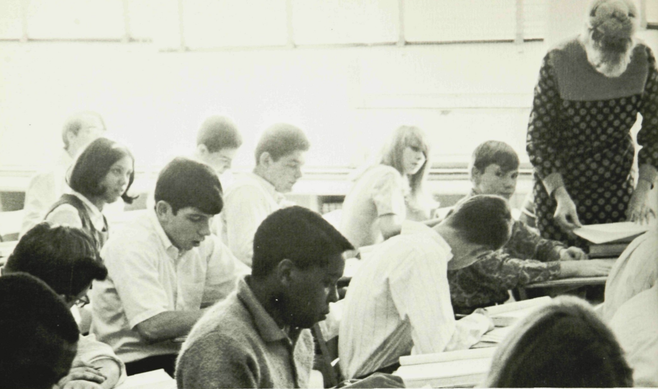
Students take advantage of "extra help" sessions offered by the Math Department after school.