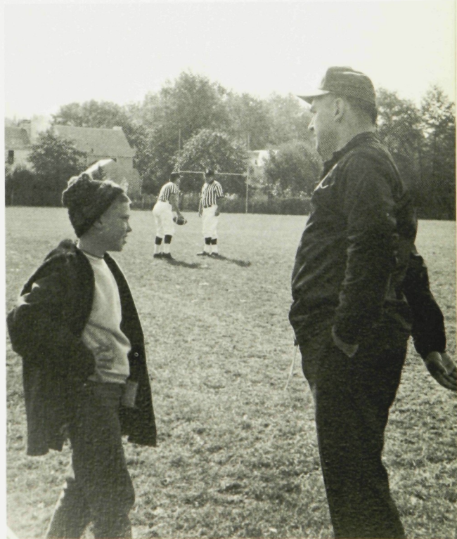
"Son, someday you'll play varsity for me!"