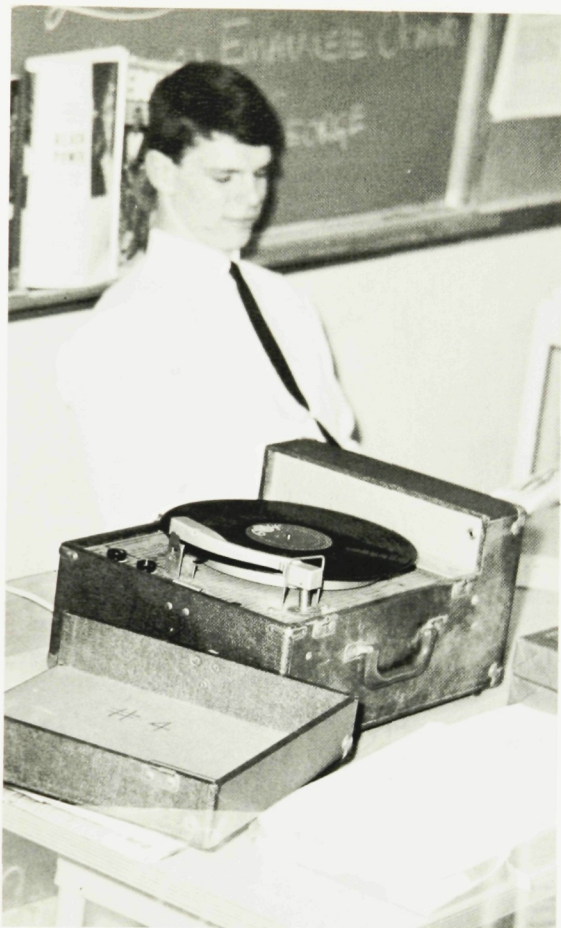
The Phonographs are used quite frequently by all departments.