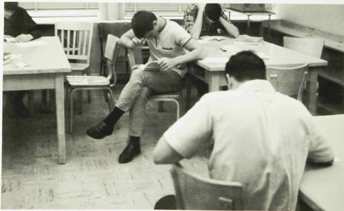
Specific stories are assigned to students to improve reading skills.

Our school offers three reading courses—Basic, Advanced, and Reading Improvement. Basic Reading is geared toward helping the student attain a normal reading level, while Advanced Reading, a one-semester course, is designed for those reading at normal ability, but who wish to reach a higher level. Reading Improvement, a six-week course, is mainly for college bound seniors. It helps to prepare them for the tremendous reading load required at college by improving speed and comprehension, and also builds a good knowledge of vocabulary.