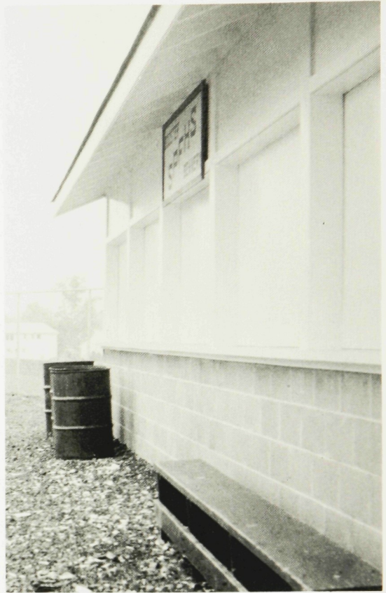
Refreshments were provided by the Booster Club and sold in the Beanery.

The new stadium certainly boosted athletics both at S.P.F.H.S. and in Union County. The Grastex composition track made possible several new track events. The school held a Scotch Plains Invitational Relay Meet in the winter, and the Union County Relay, previously held at Westfield, took place in the new stadium. It would have been difficult for there to have been an increase in attendance at football games, but the stadium was at least one reason for the high degree of school spirit present among students—it gave one more reason to yell, "We're from Scotch Plains; nobody's prouder!"