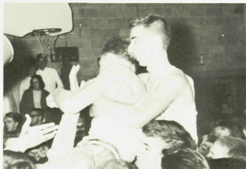
Victory over Westfield