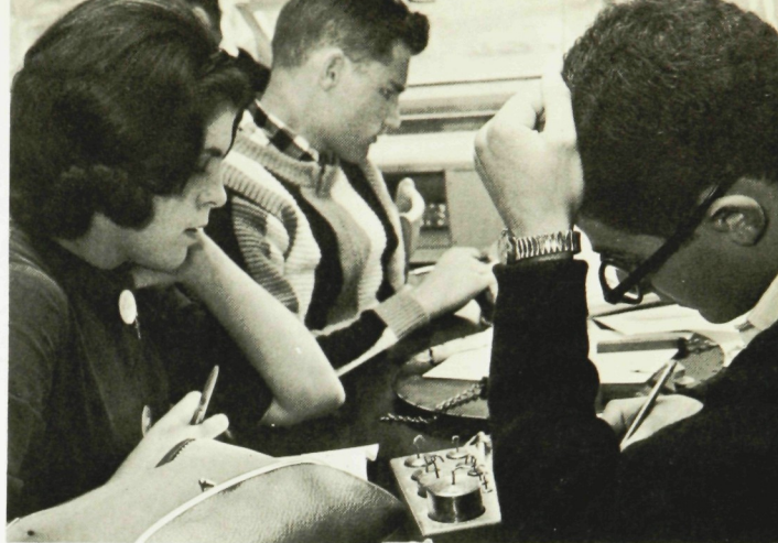
"Who said physics was easy?"