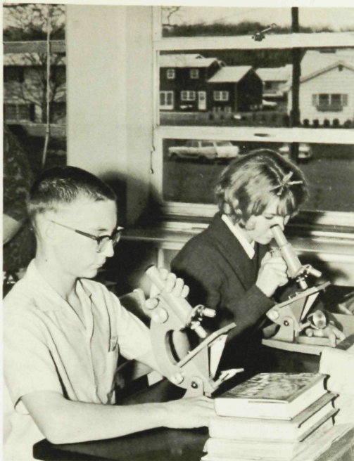
"Maybe if I look a little closer?"