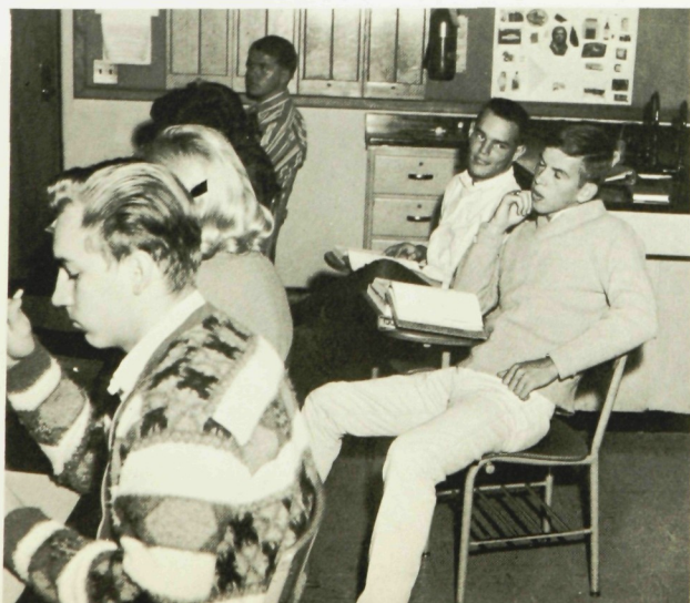
"Another electrifying chemistry period."