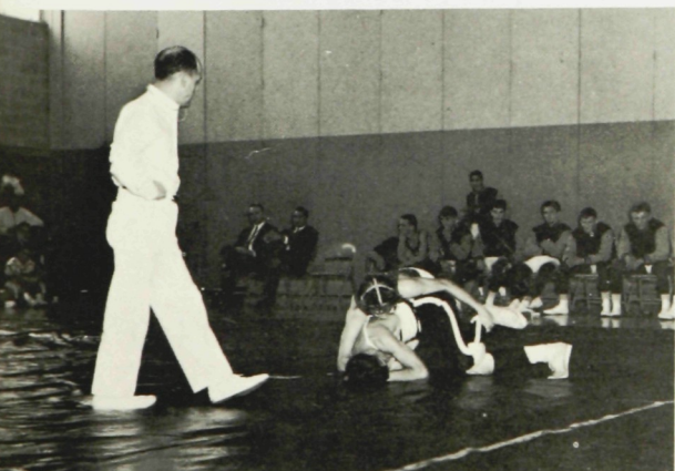
". . . And a kick in the pants for the winner!"