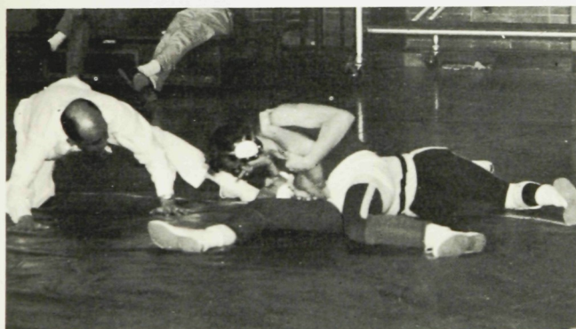
"Hold 'im 'til I get some rope!"