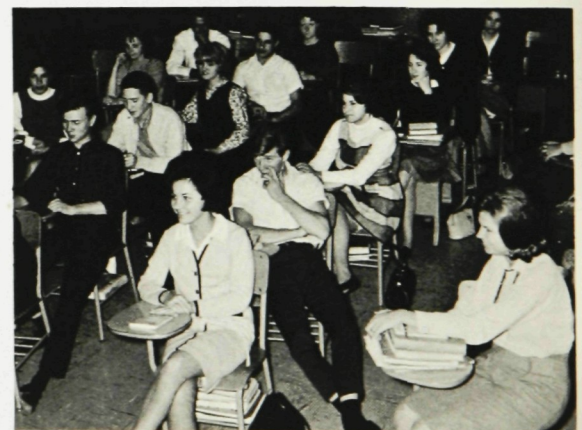
"... like I always say—Good posture is the key to good health!..."