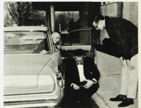
"... 6 1/8 inches—too bad, you fail..."