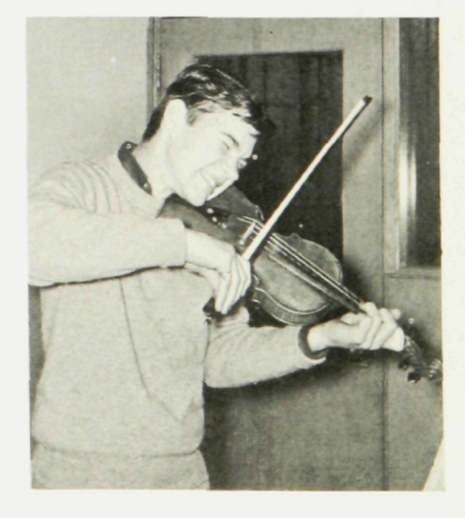
"... however, with a little more practice ..."