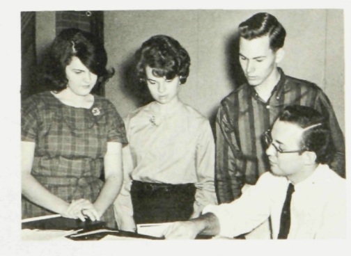
"No, you're not all singing soprano."