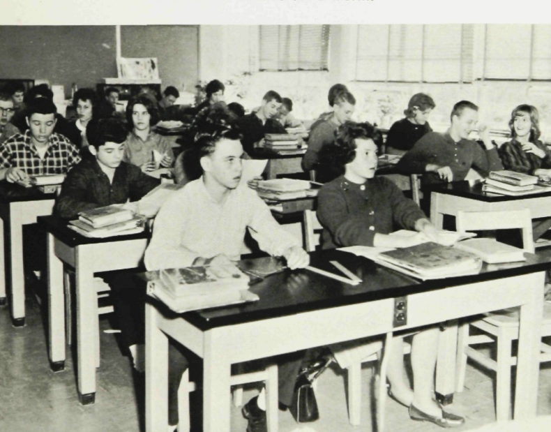
"Well, so far, out of 495, I have 86 points."