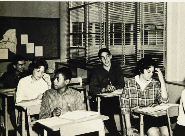
"Did you say Shakespeare?"