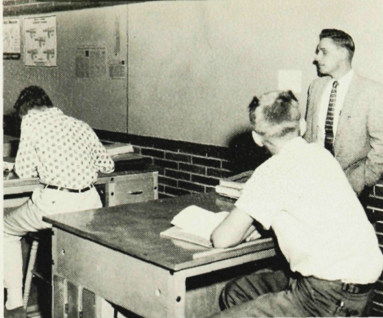
You don't always draw in Mechanical Drawing.