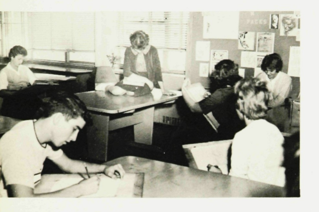
Working with figures in art class.

The excellent facilities of the art rooms allow students to model in clay, draw, paint, and generally express themselves with their hands.