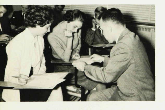
"My son wears bread."