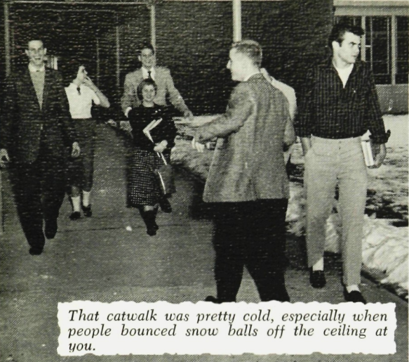
That catwalk was pretty cold, especially when people bounced snow balls off the ceiling at you.