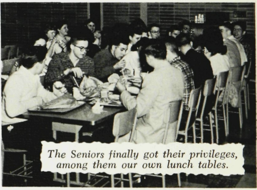
The Seniors finally got their privileges, among them our own lunch tables.