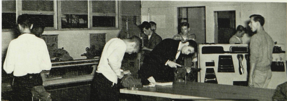
The boys are working in shop.