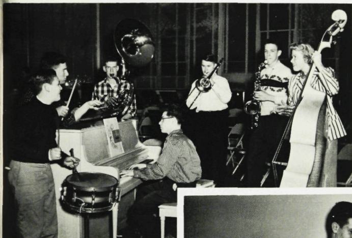
The band rehearsal will be late starting again, for the musicians are having another "jazz session."