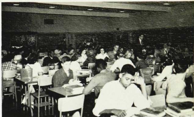
The study hall is "quiet" and everyone is "working"