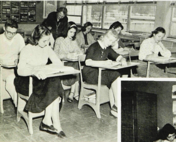
The French III students are busily working in their notebooks.