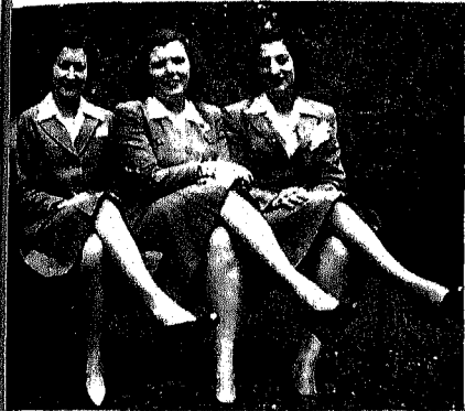
THE TRIPLE CROSS or HOME TALENT --- AND PROUD OF IT

Either caption might be appropriate for our pin-up picture this month.