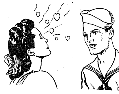
OH, WHAT A BEAUTIFUL HUNK OF MAN

A few of our service men home of leave are always to be seen at even high school football game. They awalways the objects of admiring glances from the fair sex, and as we passed one group of bobby-soxers, we overheard one say of a passing youngob, "Oh, what a beautiful hunk of men!"