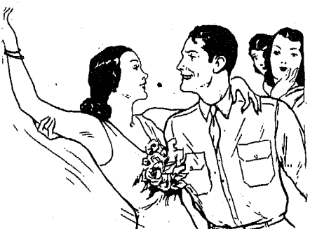
"I HAVE MARRIED OVER HERE"