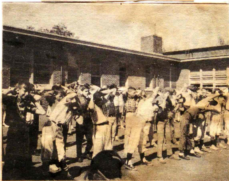
"TAKE ME OUT TO THE BALL GAME" with calisthenics was performed Friday as part of the Arbor Day outdoor festival held at the Shackamaxon School by the fifth and sixth graders.