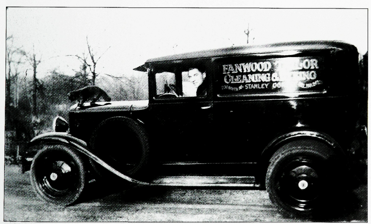
FANWOOD'S TAILOR. This panel truck made pickups and deliveries to the area's well-dressed. This was just one of the many small South Avenue businesses that served residents in the 1930s.