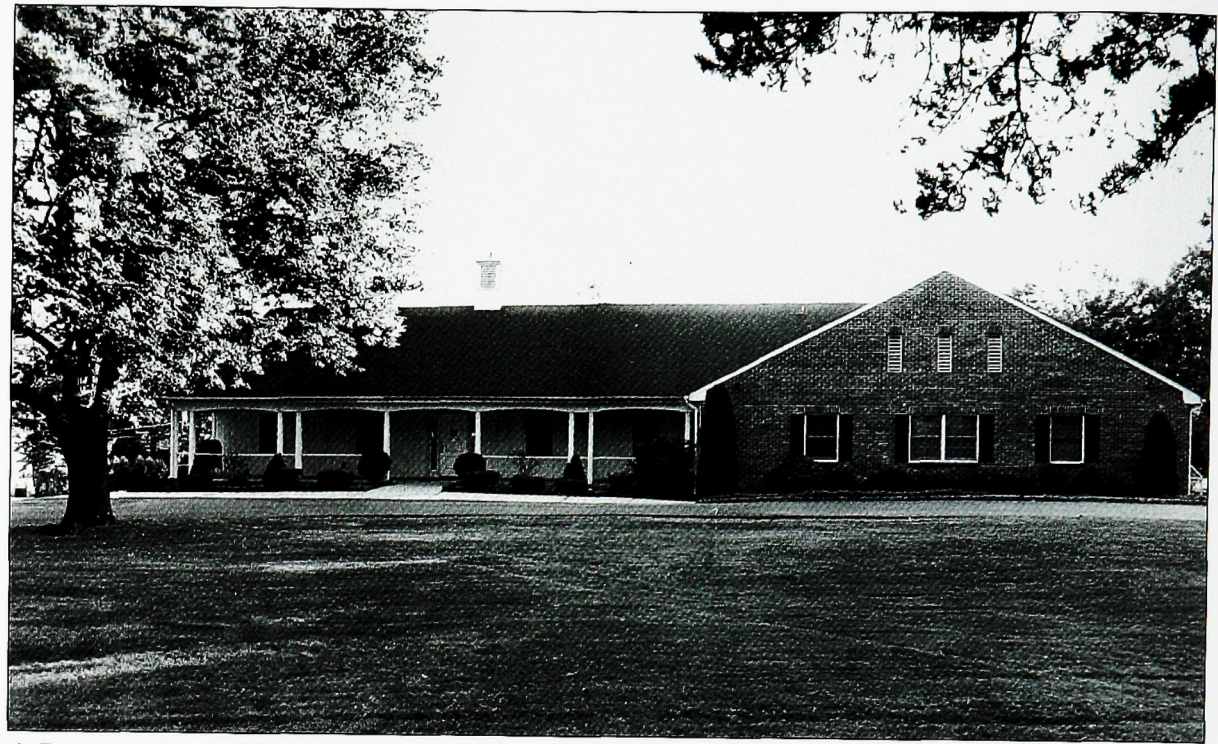
A REPLACEMENT. The new borough hall was erected in 1979 on North Martine Avenue on the site of the former Homestead Hotel.